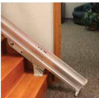
Power or manual folding rail for narrow hallway or when doorway is at the bottom of stairs. Manual operation or push button automatic.