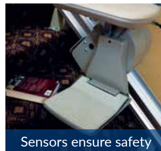
Sensors ensure safety