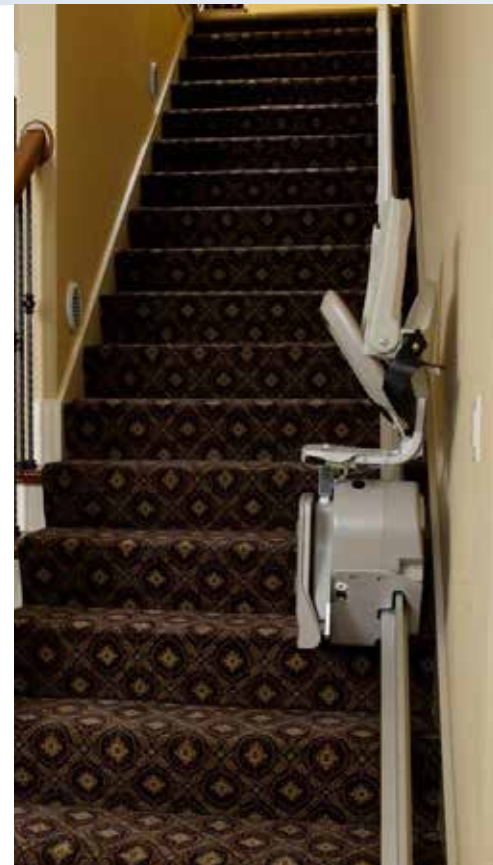
Compact, flip-up design for plenty of open space on stairway.

“Green Bay Packers Hall of Fame Quarterback”