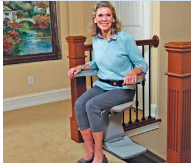
Offset swivel seat makes getting on/off easy.