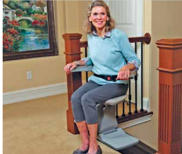
Offset swivel seat makes getting on/off easy.