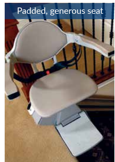
Padded, generous seat