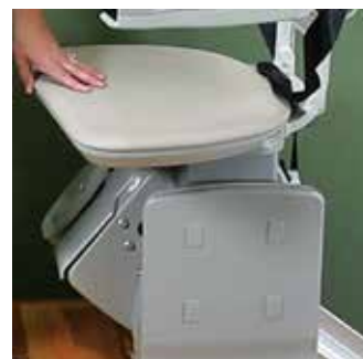
Power swivel seat for effortless exit. Armrest switch control or wireless call/send.