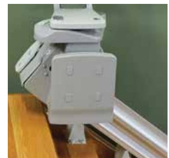
Power folding footrest automatically flips up/down when seat is raised/lowered. Arm switch control optional.