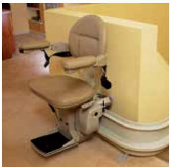
Top or bottom park position extends rail away from the staircase.