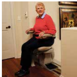
Power swivel seat for effortless exit. Controlled on chair arm or wireless call/send.