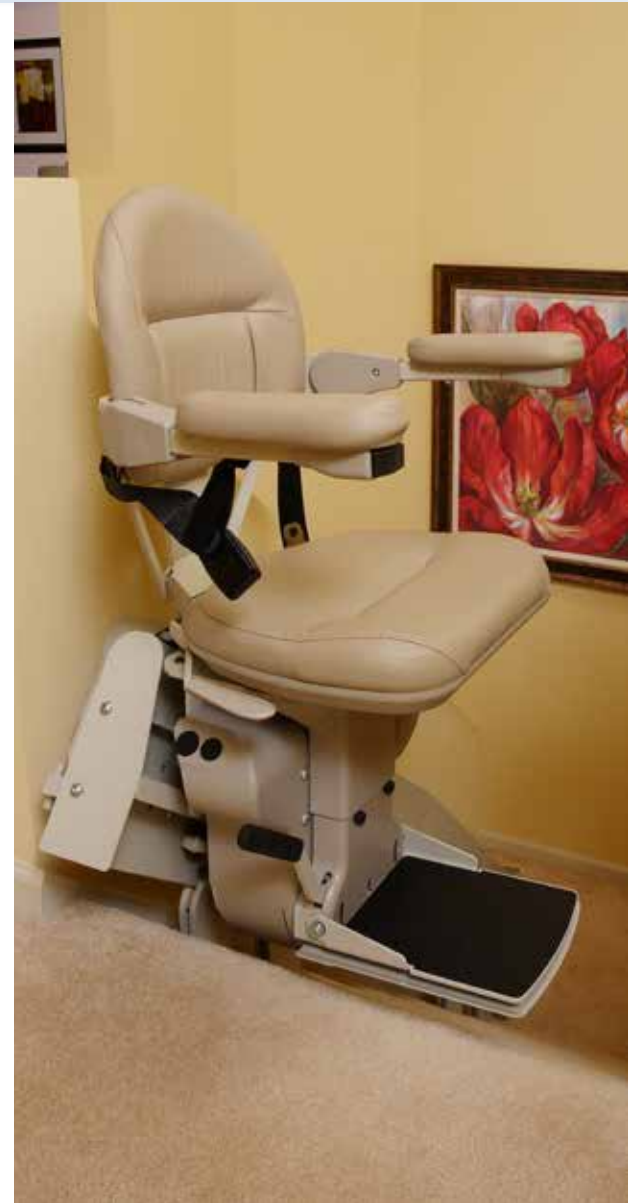
Luxury styling and comfort.

“Green Bay Packers Hall of Fame Quarterback”